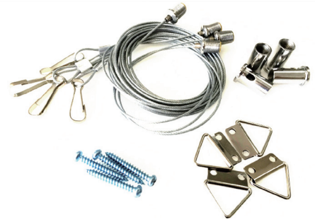
300x1200 Hanging Kit